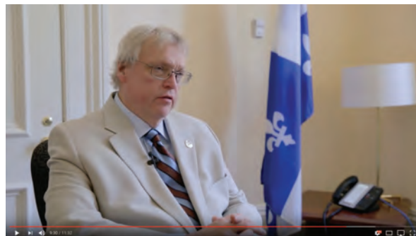
MEI documentary—Doctorless clinics: Why not let patients decide?