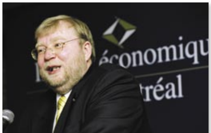
Mart Laar, former Estonian Prime Minister.

As in past years, a series of prestige speakers agreed to address audiences invited by the MEI. Six major speeches were organized in 2004, gathering a total of more than 800 participants. The series began with a theme we have emphasized since the very start of our activities, namely reform of the public health care system. Former Minister